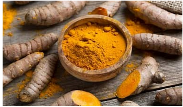
Figure 1 Turmeric ( Curcuma longa ) rhizome powder

Twenty West African Dwarf breed of goat-does, age range of 18–24 months with an average live-weight of 13.84 kg, were used for this study. All the does were selected from goats Unit of Teaching and Research Farm. The goat-does were acclimatized for two weeks in their new pens,