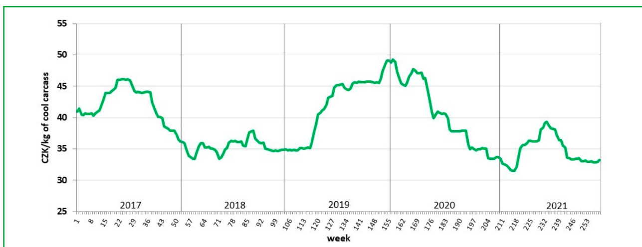
Figure 2 Average price of slaughter pigs (SEU class) in the Czech Republic over the last five years