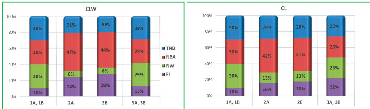
Figure 4 Structure of the studied index variants in dam pig breeds CLW – Czech Large White; CL – Czech Landrace breed; 1 – current index; 2 – optimised index; 3 – adjusted index; A – “stable” economic weights; B – “declined” economic weights (for the index variant 1A and 1B the same traits proportion was applied; the same was true for the variant 3A and 3B); TNB – total number of piglets born, NBA – number of piglets born alive, NW – number of piglets weaned (all expressed per litter), and FI – farrowing interval of sows (in days); Source: own calculation

the context of the studied alternatives of EWs presented in the optimal index construction (i.e., 2A and 2B), the deteriorated economic conditions increased FI by 4 and 2 percentage points in CLW and CL breed, respectively.